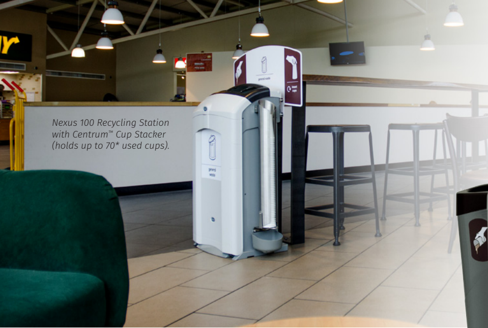
Nexus 100 Recycling Station with Centrum™ Cup Stacker (holds up to 70* used cups).