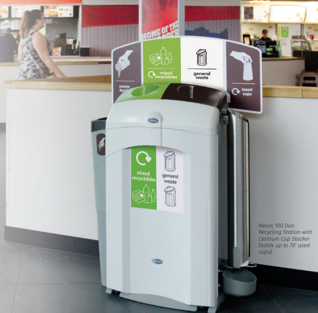
Nexus 100 Duo Recycling Station with Centrum Cup Stacker (holds up to 70* used cups).

Optional: Foamex sign kit with standard or personalised graphics.