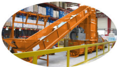
Option: conveyor belt

A completely automated waste management solution designed for continuous infeed, automatic horizontal or vertical strapping system with adjustable wire links, which enables you to yield optimal output.